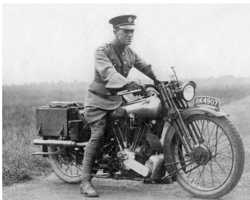
Below: Lawrence on his beloved Brough Superior motorcycle that he called George V

a bestseller. He gave the proceeds to charity and wrote a new book, The Mint , about his time in the RAF. He also translated Homer's Odyssey for an American publisher and used the advance to pay off the purchase price of Clouds Hill. Finally he was shaking off his reputation as a man of action in favour of that of a man of letters.